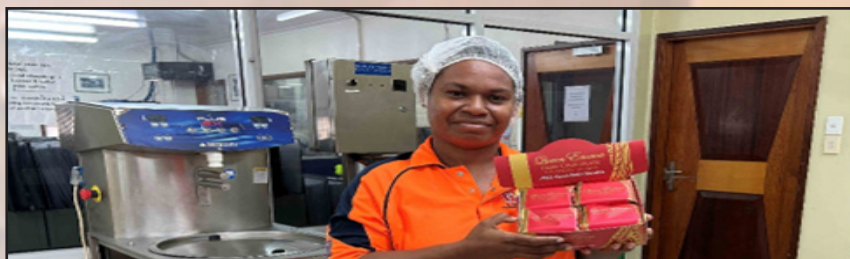
Queen Emma chocolate bars are ready for shipment to markets.