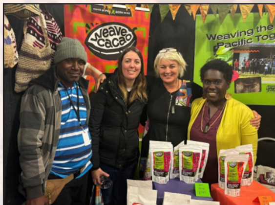
Queen Emma General Manager and a leading Sepik Cocoa Producer attending a cocoa show in New Zealand with FAO support under the EU-STREIT PNG Programme.

Inside the factory, the FAO support is expanding and modernising critical stages of processing. Twelve types of new machines are being delivered to upgrade capacity and quality. This investment support, valued at USD 2.8 million, doubles output and enables consistent, higher-grade production of cocoa ingredients and chocolate. With better equipment, Queen Emma expects steadier output, sharper quality, and the ability to meet orders on time and in full. These upgrades also position the company to work toward food-safety certifications demanded by specialty buyers.