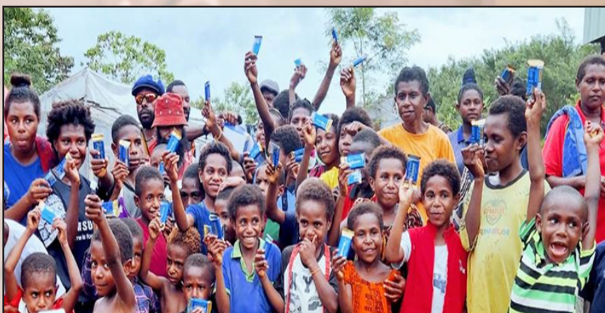
Queen Emma chocolate bars enchanting the children of Papua New Guinea.