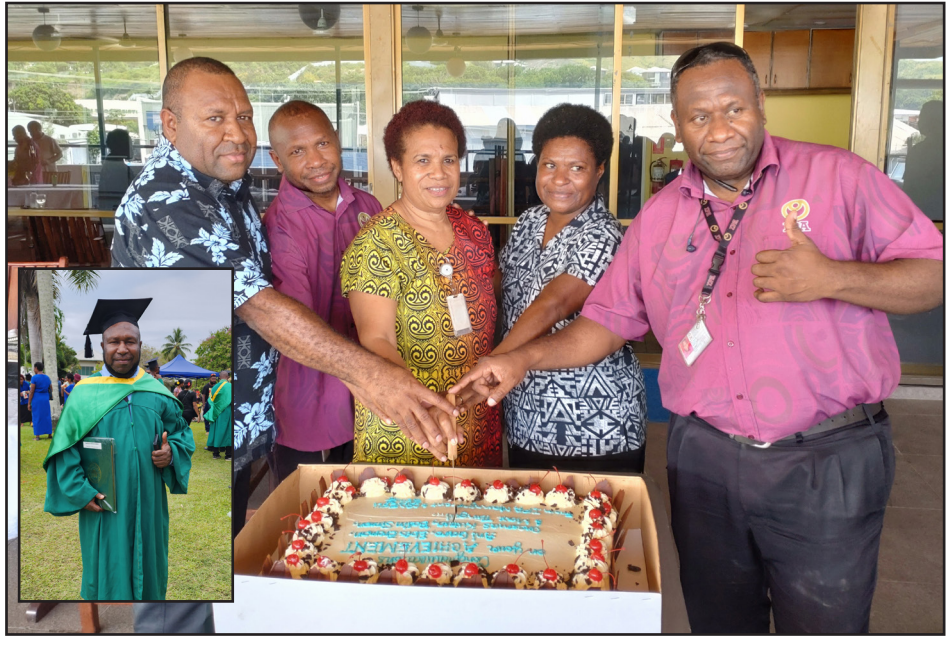
IPA staff who graduated after taking various courses