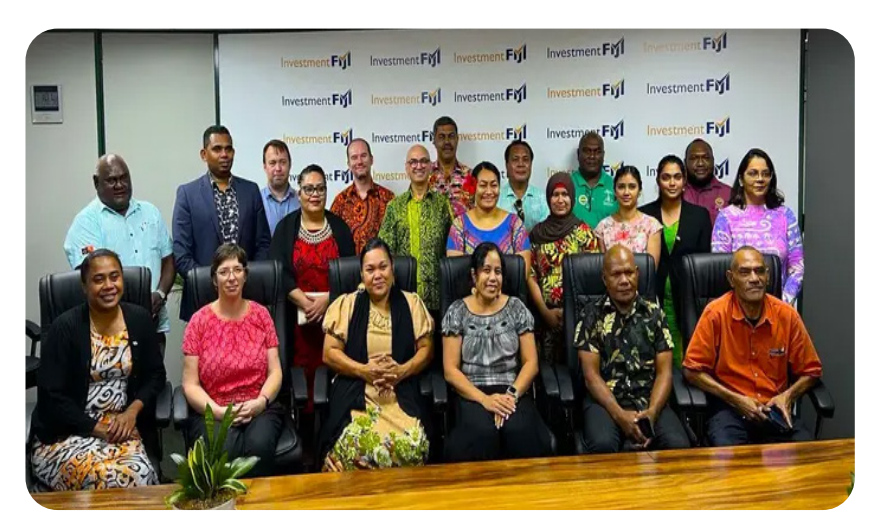
Participants from various Pacific Island countries who attended the week-long training workshop.

The World Bank Group has undertaken a new initiative to support Pacific Island Countries (PICs) in building their capacities for investment promotion.