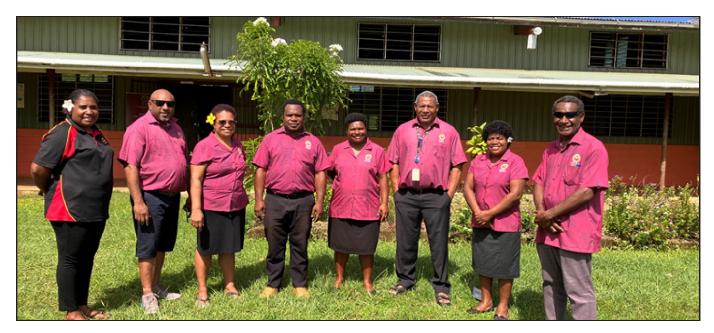
IPA officers who travelled to Kavieng, New Ireland Province for the awareness.

During the awareness the team talked about the efficiency of the online registration system and gave practical scenarios of cost and time for lodging at the counter compared to lodging online.