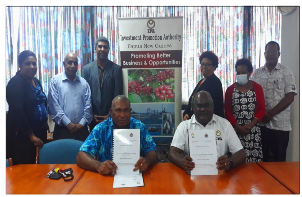
IPA management team and officers from the Fraud and Anti-Corruption Directorate posing after the signing of the MOU

He said that any other information requested will have to be released after appropriate legal processes have been followed. NFACD is also inviting other Agencies to contact its Office to discuss possible partnerships.