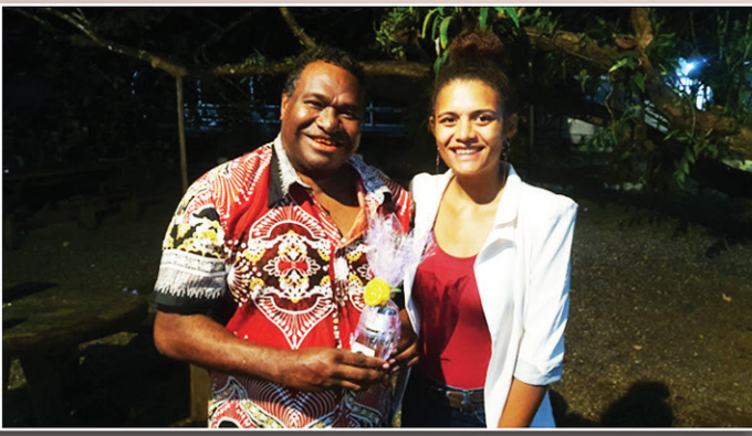
Yanua Kitchen jam presented to Deputy Prime Minister Hon. Davis Steven (Member for Esa'ala).

moted it on social media and we still have orders for that which we will still look into as soon as we get larger equipment to grind the peanuts. The limited local supply and high prices for peanuts is also a challenge for us at this stage".