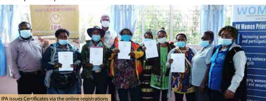
INVESTMENT PROMOTION AUTHORITY | Page 3