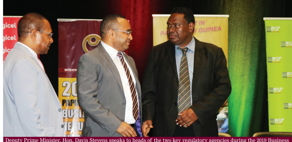
Deputy Prime Minister, Hon. Davis Stevens speaks to heads of the two key regulatory agencies during the 2019 Busine Regulators' Summit held on the 19th - 20th September, 2019.

• Conduct a stock-take on all registries by Registrar of Titles and Registrar of Companies and subsequently develop a central interface to monitor all property owners. This will give consolidated background on any future reforms.