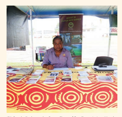
IPA Booth display at the Cocoa Show of Excellence in Lae, Morobe Province.

Simbu Province will be the host for the next Cocoa Show of Excellence.