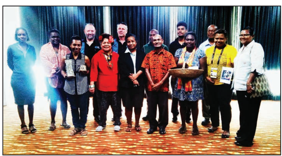
Above: Participants in the Path to Market Workshop held in Port Moresby on August 21st, 2018.

orty (40) Pacific companies from thirteen Pacific Island countries have been invited to be part of a trade mission to New Zealand called "Path to Market Mission". The mission is a part of the Pacific Islands Trade and Invest (PTI's) Path to Market Programme which is a seven-step export capability building programme for Pacific Island companies.