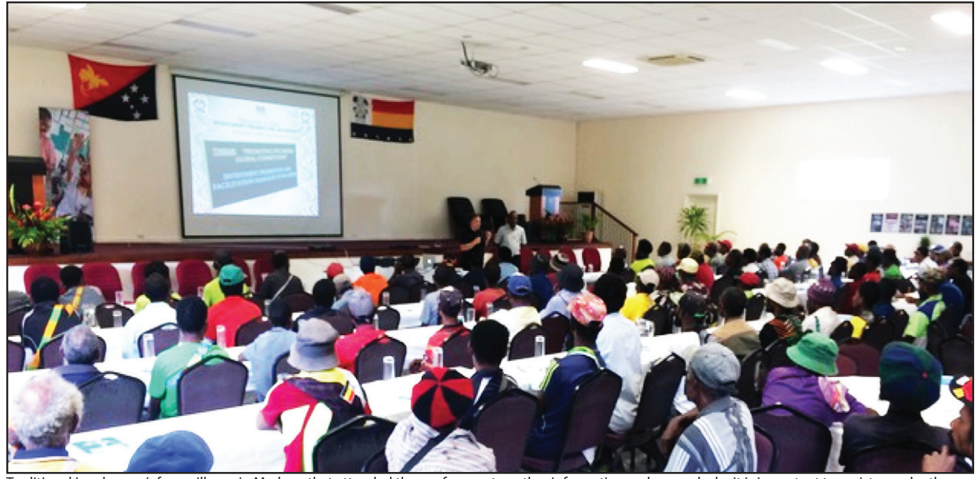
Traditional Landowner's from villages in Madang that attended the conference to gather information on how and why it is important to register under the Investment Promotion Authority.

The company is focused on building long term relationship with the locals for a strategic business partnership in cultivating and exporting high quality PNG vanilla beans, at the same time protecting the origin of the commodity.