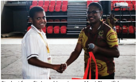
Student from St. Joseph's recieves a Moni-Plus gift bag during the Educational Quiz Session.