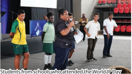
celebrations taking part in an activity conducted by PNG Sports Foundation