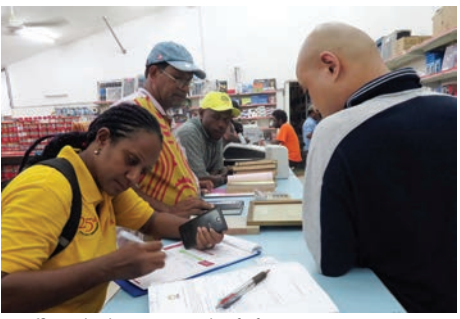
IPA officers checking paper works of a foreign company in Kavieng.