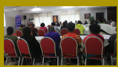
lage Inn in Wewak. Participants listening atten-

Some of the common issues raised include the inability of businesses to pay tax as a direct result of the government not paying its bills.