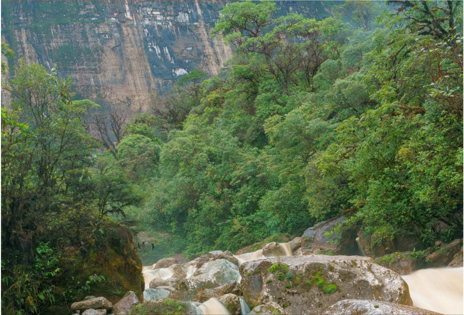
Ok (river) Kaakil below Hindenburg Wall, Western Province, PNG. The Hindenburg Wall is sometimes described as a natural wonder of the world. In 2013 a WCS survey documented 1108 plant and animal species at the wall, of which at least 89 are new to science.

BUSINESS COUNCIL OF PAPUA NEW GUINEA VOICE OF THE PRIVATE SECTOR