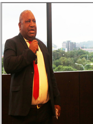
Hon. Win Bakri Daki, Minister for Commerce & Industry expressing satisfaction during the PNG-Japan Business Forum.

Minister for Commerce & Industry, Win Bakri Daki through the Papua New Guinea Investment Promotion Authority (IPA) has praised the 50- member delegation from Japan who were recently in the country seeking business and investment opportunities.