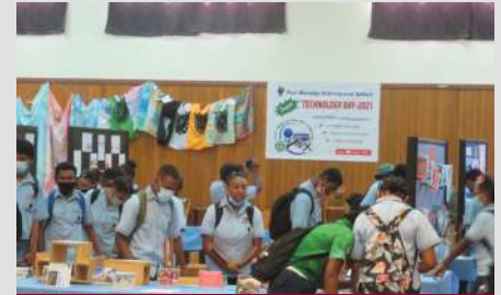
POMIS students visiting display booths

A booth was also set up in the school's display room where students who visit