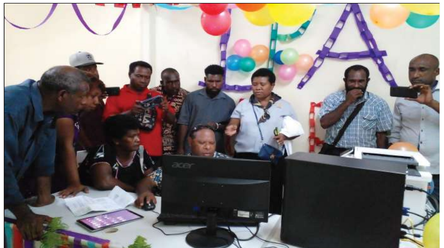
The New IPA Helpdesk for West New Britain Province

This is the standard assistance IPA gives to all the Provinces that it signs an MOU with. Other related costs are to be borne by the provincial administrations, in this case the West New Britain Provincial Administration.