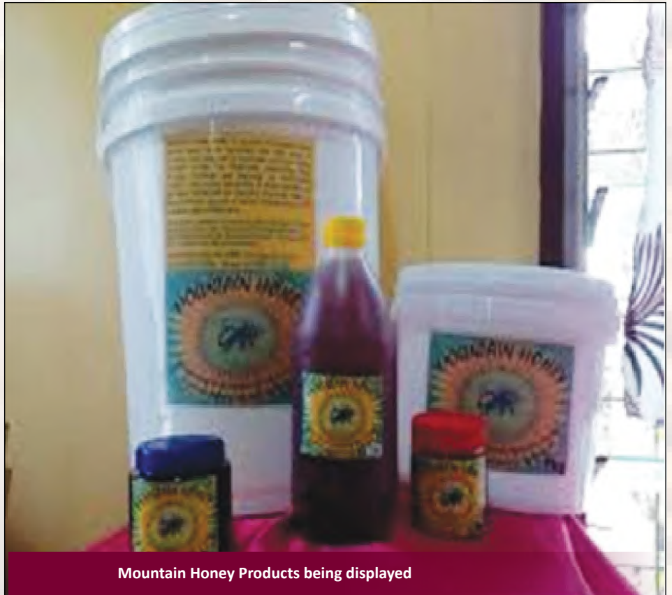
Mountain Honey Products being displayed

Mountain Honey is seen as a sustainable business and the products are sold domestically in supermarkets in Papua New Guinea. The products are also packed in different volumes and grams and sold to individuals and businesses around the country.