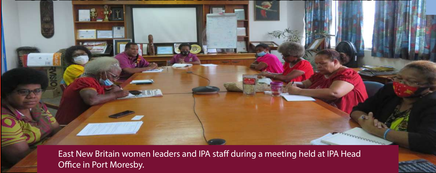
East New Britain women leaders and IPA staff during a meeting held at IPA Head Office in Port Moresby.

A group of women Leaders from East New Britain Province visited the Investment Promotion Authority’s Head office in Port Moresby in September meeting to have an awareness with IPA.