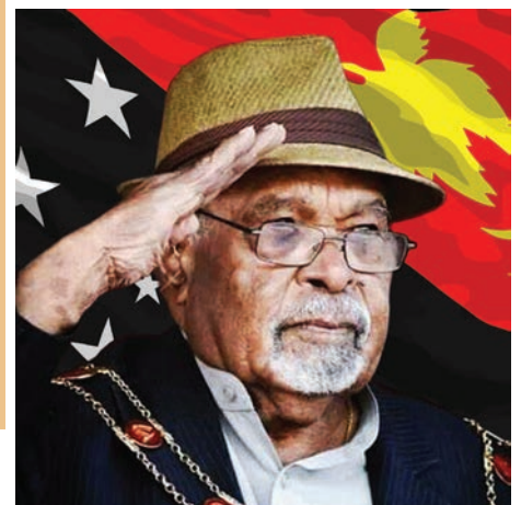
FATHER OF THE NATION. LATE GRAND CHIEF SIR MICHAEL THOMAS SOMARE GCL GCMG CH CF SSI KSG PC

The late Grand Chief Sir Michael Thomas Somare, known as the father of the nation died at the age of 84 after serving Papua New Guinea as Prime Minister for 17 years over four (4) terms in a total of 49 years in politics. He led PNG into independence from Australia in 1975 and was one of the country's longest-serving politicians, with a career that spanned five decades.