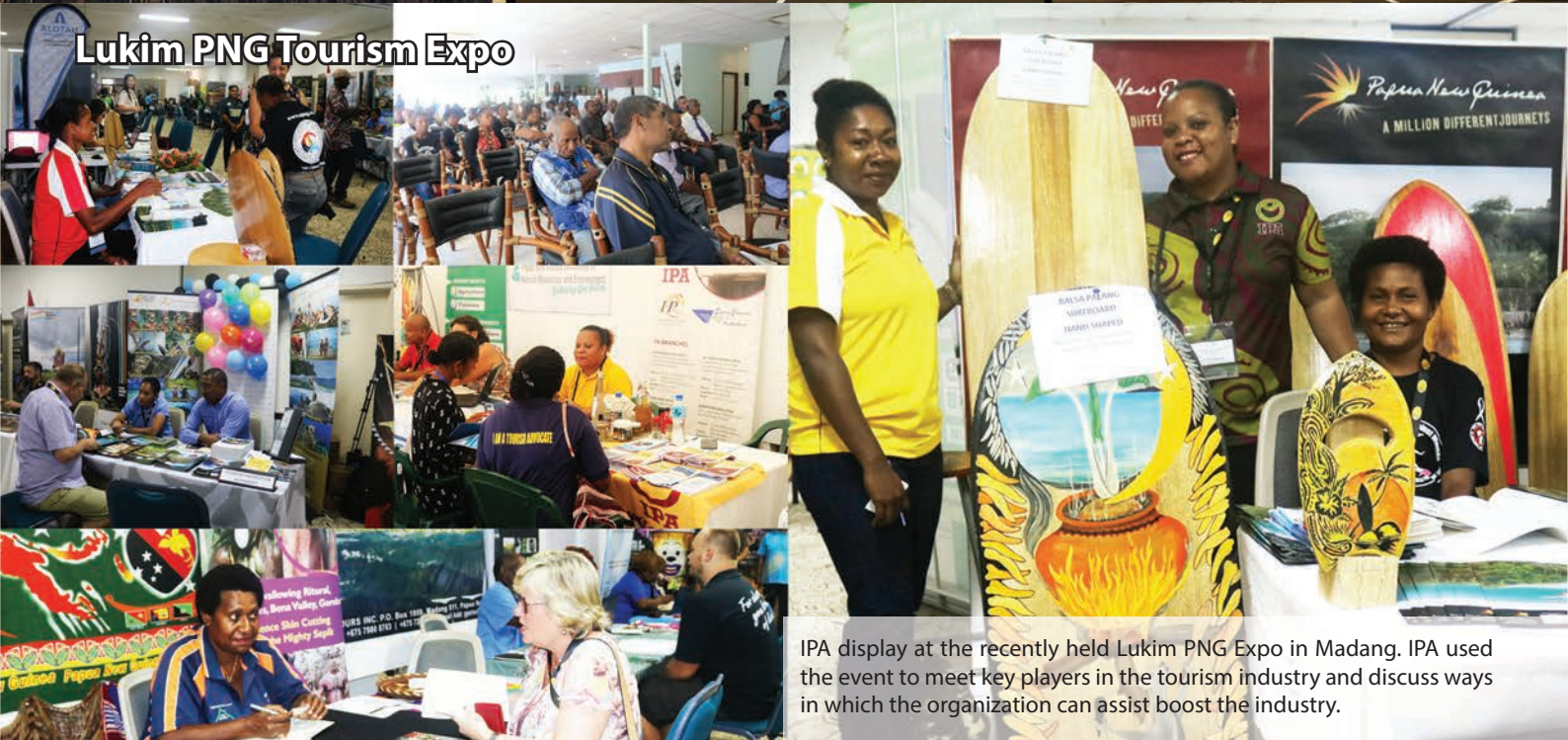
IPA display at the recently held Lukim PNG Expo in Madang. IPA used the event to meet key players in the tourism industry and discuss ways in which the organization can assist boost the industry.