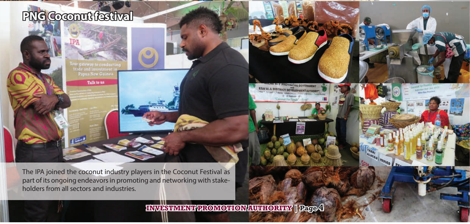
The IPA joined the coconut industry players in the Coconut Festival as part of its ongoing endeavors in promoting and networking with stakeholders from all sectors and industries.