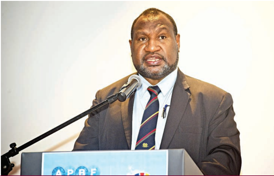
Prime Minister Hon. James Marape delivering his opening remarks at the APBF at the APEC House.

The Asia Pacific Business Forum (APBF) was successfully held in Port Moresby for the very first time outside of the Asian region on Friday 21st June, 2019.