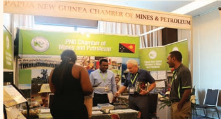
Booths display during the forum at the Stanley Hotel.

Delegates were further briefed on the range of policy issues currently causing concerns to the resources sector like mining and petroleum which may potentially have a negative impact on future investment decisions.