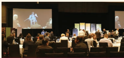
200 plus attendants during the 35th Aus-PNG Business Forum at the Stanley Hotel in Port Moresby.

The 35th Australia Papua New Guinea Business Forum and Trade Expo with the theme "The Road Ahead: Optimizing Infinite Opportunities" ended on a high note on Tuesday 18th June, 2019.