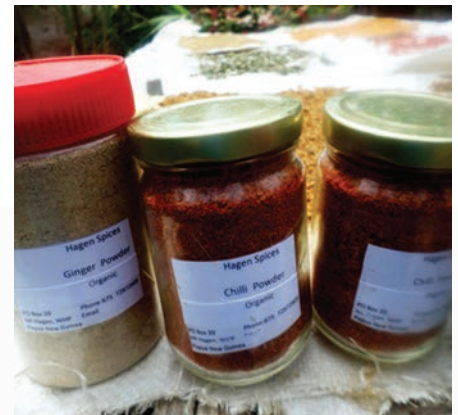
Processed Spices in bottles