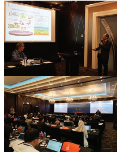
Photos taken during the ECSG meeting

The APEC Business Advisory Council and the Pacific Economic Cooperation Council have also been applauded for their contributions.