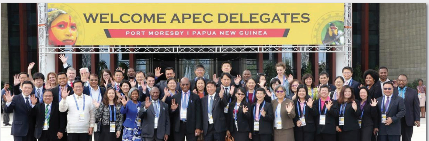
Picture taken during one of the meetings leading up to the Minister's Meeting

Asia-Pacific Economic Cooperation (APEC) Ministers, have reaffirmed their commitment in addressing the challenges faced by its member economies on work towards achieving APEC's goal of free and open trade and investment in the region.