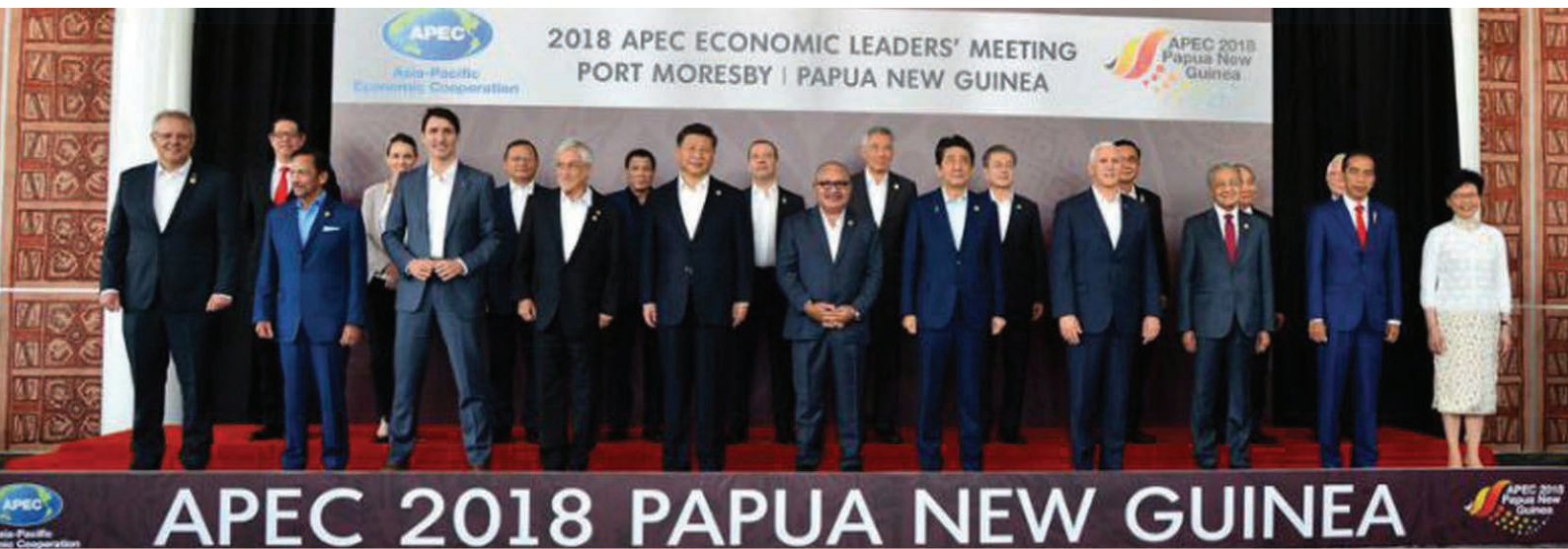
26th APEC Economic Leaders' Meeting wrapped up on November 18 in Papua New Guinea.

Papua New Guinea successfully hosted a total of more than 500 meetings as the 2018 Asia Pacific Economies Cooperation or APEC year came to a showdown.