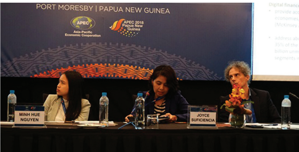
Photo taken during the Electronic Commerce Steering Group meeting

A new governance mechanism “The Digital Economy Steering Group” has been set up to progress the implementation of the APEC Internet and Digital Economy Roadmap.