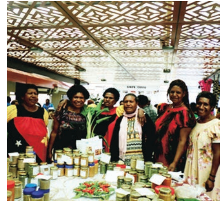
Highlander Hotel Exhibition