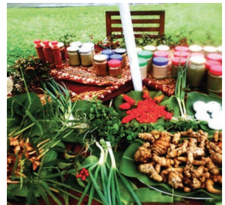
Displaying raw spices