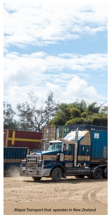
Mapai Transport that operates in New Zealand

The IPA will be facilitating interested applicants for the 2017 Trade Pasifika Festival which will be held from March 25-26 next year.