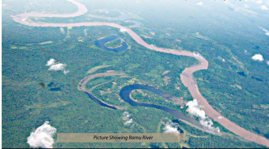
Picture Showing Ramu River

The registered company represents twelve (12) landowner clans within the project area.