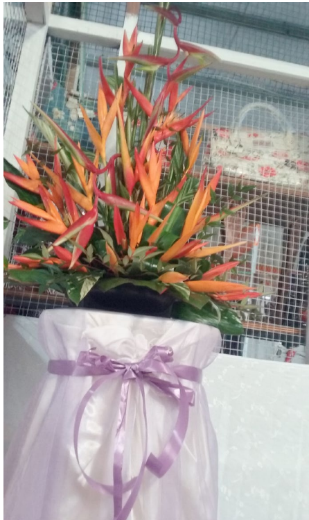
Rainbow flower finished products.

So, if you're thinking of something special for your loved one then head down to the PNG Women in Business-run trade centre in Waigani and see Rainbow Flowers for yourself.