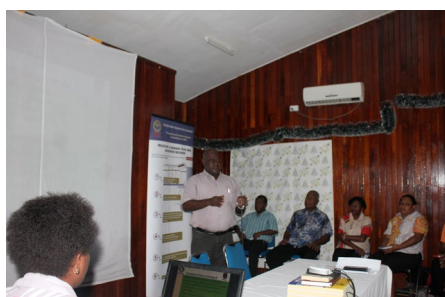
Participants at the Vanimo workshop