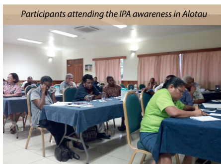
Participants attending the IPA awareness in Alotau

The Provincial Outreach Program exercise is ongoing and is intended to cover all the provinces in the country going forward.