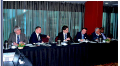
PNG stakeholders hold round table talks with the delegation at Grand Papua Hotel in Port Moresby. The delegation was led by PNG's Ambassador to Brussels his Excellency Joshua Kalinoe.

Papua New Guinea can expect further cooperation with European countries following the visit of the first European Investment Delegation to the country from March 9-12.