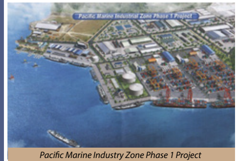
Pacific Marine Industry Zone Phase 1 Project

The construction phase of the multi million Tuna Processing facility in Vidar, Madang is set to kick start this month in April.