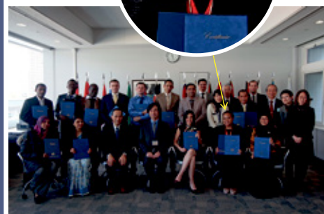
Ms Kiromat seated front second from right with other participants at the conclusion of the training program.