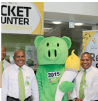
The Games Organizing Committee officially launch the sale of 15th South Pacific Games Ticket.

If you require more information, call the 2015 Pacific Games hotline on 180 2015 or visit them at: www.portmoresby2015.com