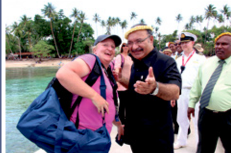
Prime Minister Hon. Peter O'Neill welcomes tourists to Kaibola.

Cruise ship tourism is quickly taking shape in Papua New Guinea according to Tourism Promotion Authority Chief Peter Vincent.